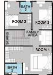
A2B 1 ST FLOOR PLAN