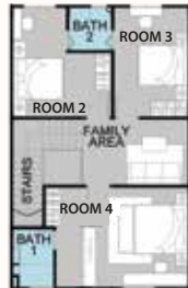
A1 1 ST FLOOR PLAN