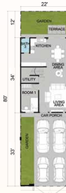
A2B GROUND FLOOR PLAN 22' x 80'