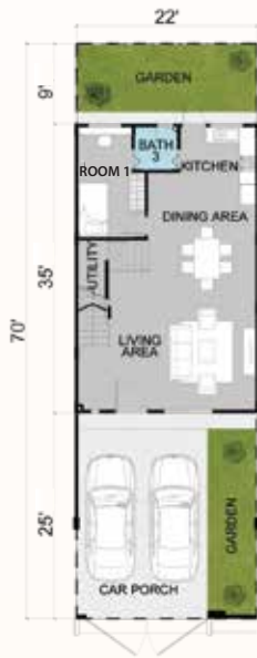
A1 GROUND FLOOR PLAN 22' x 70'